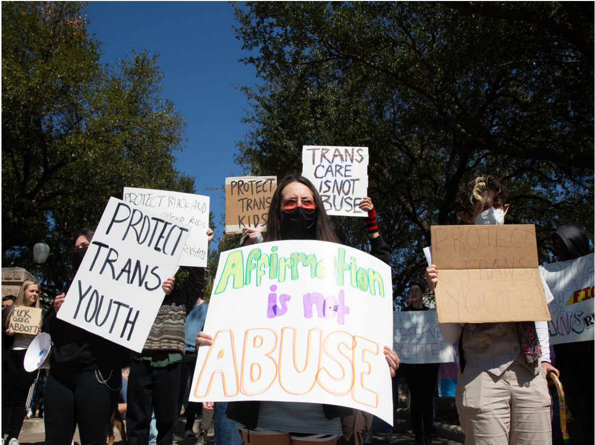
As Texas moves to treat gender-affirming care for trans kids as 'child abuse,' families and advocates worry about the future

Document 5 - Protesters rally against the criminalization of medical treatment for trans kids in front of the state Capitol on Sunday, Feb. 27, 2022.