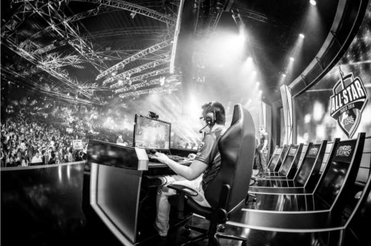
All-star League of Legends, Paris, 2014